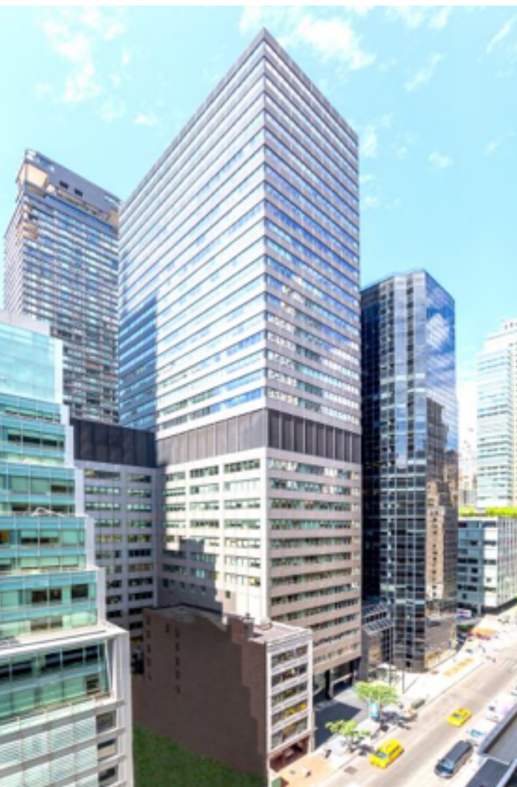
Jack Resnick & Sons' 110 East 59th Street

Jack Resnick & Sons has announced a 16-year, 151,890 s/f lease renewal by long-time anchor tenant Cantor Fitzgerald at 110 East 59th Street. The global financial services firm will continue occupying full floors on the 37-story East Midtown building's second through seventh and 15th floors.